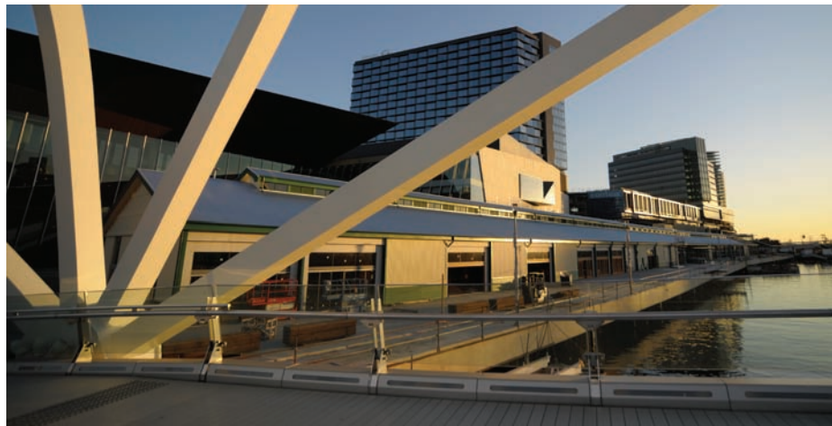
South Wharf complex from Yarra Footbridge

KLM Group and Allied Technologies Australia have completed projects that have included service and maintenance, fit-out and construction projects - power, lighting, security surveillance, energy audits, voice & data structured cabling, optical fibre and copper cabling, MATV cabling, audio and video conferencing, interactive whiteboards and digital display systems.